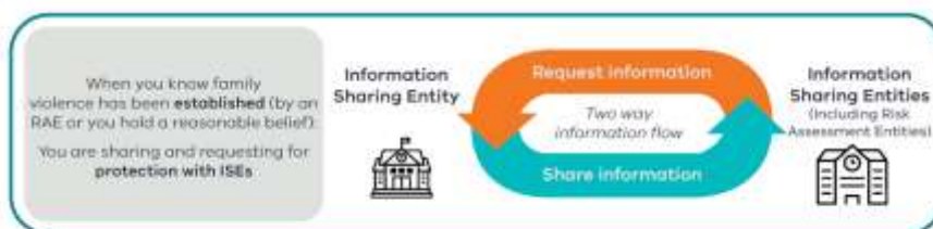
Figure 2: Overview of activities when sharing information for risk management (protection)

This opens a two-way flow of information that enables ISEs to form a complete picture of risk and collaborate to support children and families experiencing family violence.